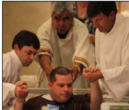
Photo of an adult baptism at St. Joe's

It's been the longest, coldest, wettest winter I've ever seen in Modesto. But now Spring has returned to our beautiful valley, and we have the Lord Jesus to thank for the warm breezes, sunshine, and flowers. To all our parish family, and to those who are visiting this Sunday, I wish you all a Happy Easter .