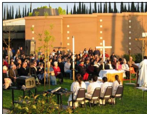
Easter Sunrise Mass

I have known young people at the peak of bodily health who are dying through habitual sin. I have known very old people with chronic bodily weaknesses who are brimming with vibrant joy.