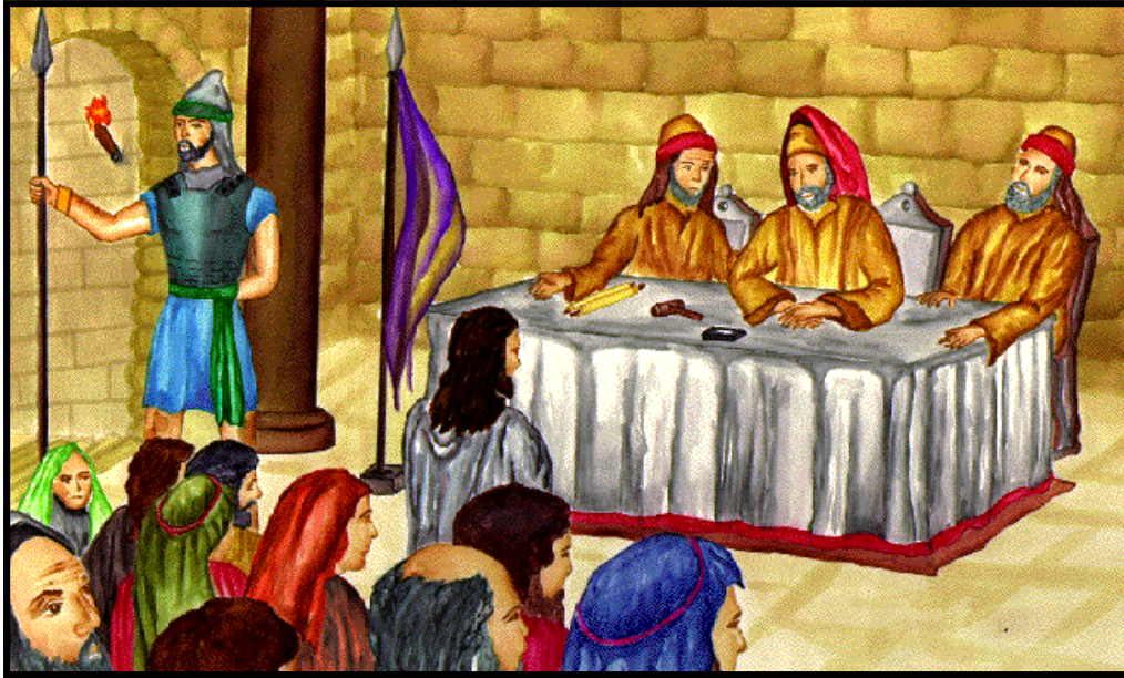
Jesus is condemned by the Sanhedrin.