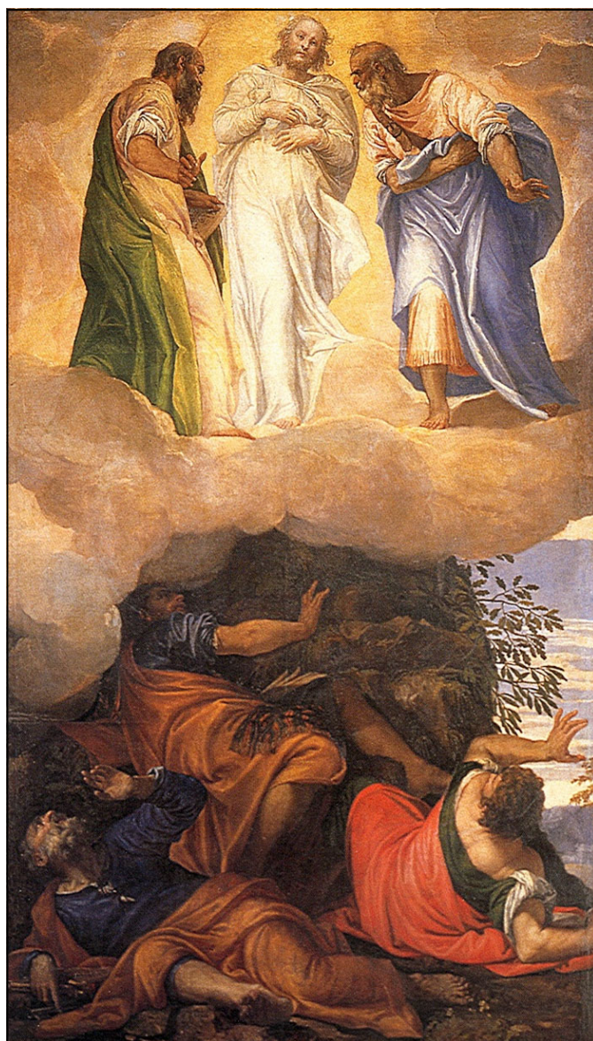
Paolo Veronese, Transfiguration of Christ , 1556 Altarpiece at the Cathedral of Santa Maria, Montagnana, Italy

Christ's glory is present in the Holy Eucharist. When we are at Mass maybe we are not thrown to the ground but are we filled with amazement and awe for the love and glory of God as we approach to receive Him in the Most Blessed Sacrament?