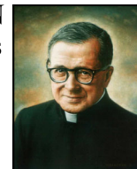
St. Josemaria Escriva