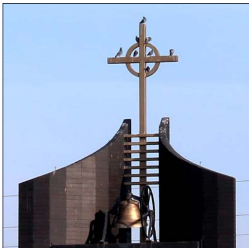
These birds on our bell tower believe!

To all this "unbelief," we Catholics say, Credo . "I believe." Our faith is not in man or things human, but in God. This Wednesday is Ash Wednesday . I believe in the Passion, Death, and the Resurrection of Jesus Christ. I believe that God lives, and lives in each of us. Let's keep a good Lent, insisting that there is still room for belief in the world.