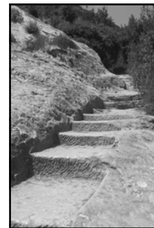
Steps up Mt. Carmel

These seven habits might seem like a lot to take on. If we honestly look at our day, we will see no matter how busy we are, the time is there! It might mean sacrificing getting your cup of coffee in the morning, spending less time watching TV or playing video games. If loving God is a greater priority in our lives, we will be blessed abundantly. Jesus said: I have come that you might have life and have it abundantly (John 10:10).