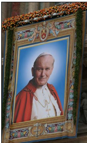
Beato Juan Pablo II

Sus palabras fueron proféticas. Estos son los puntos que han sido hechos por otros, pero solo después de que vimos cuan inútil y devastadora ha sido la guerra. El Papa Benedicto ha dicho que la Iglesia y el Estado, aunque distintos, deben de trabajar unidos. La Iglesia puede proveer un punto de vista mas amplio, y la sabiduría que el Estado, el cual es impulsado por la política, no puede obtener. La Guerra en Iraq es un buen ejemplo de cómo el Estado, ignorando la sabiduría de la Iglesia, lo hizo trayendo así su propia destrucción. Todavía ahora, pocos políticos admiten el costo de haber ignorado la sabiduría de la Iglesia. "Nunca hubiese votado a favor de la invasión de Iraq," dicen algunos de los oficiales. Aunque solo un hombre tuvo esta sabiduría en el 2003, el Papa.