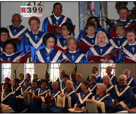
St. Joseph's Adult Choir