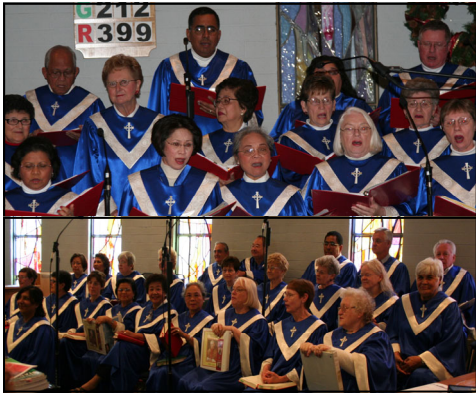
St. Joseph's Adult Choir

El papel primordial del coro de la iglesia es el de enriquecer la celebración, invitar a todos los fieles a una activa participación, y proveer música sagrada para la liturgia, que amplía la alegría, solemnidad, y belleza.