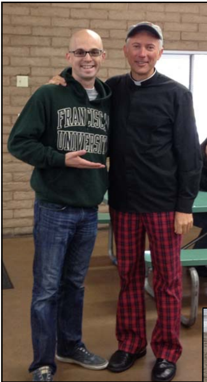
The infamous plaid pants