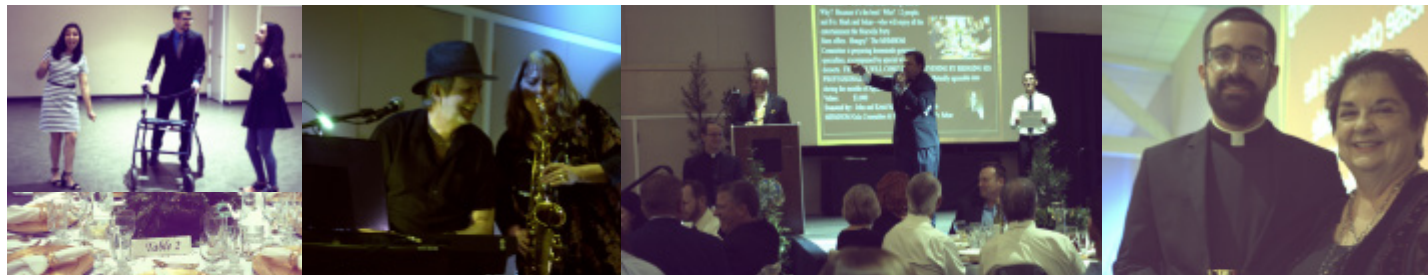
The MHMHOM Committee and our Priests