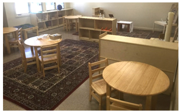
The photo above shows one of our new CGS classrooms as it is being readied for the school year.

It is a faith-based formation program where children can grow in their relationship with God through a deep engagement in Scripture and liturgy. The methodology uses "child size" furniture and faith learning environments with professionally trained volunteer catechists who love teaching our children the faith.