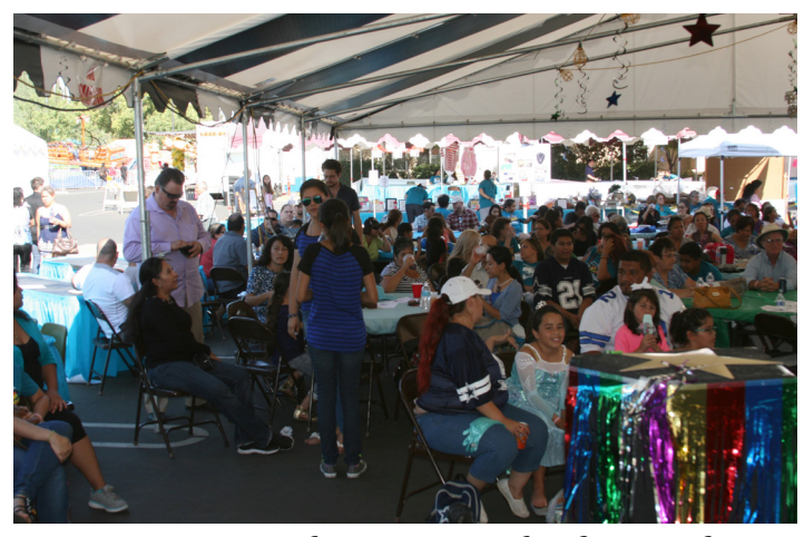
Sign-ups to volunteer at the festival start August 16th!