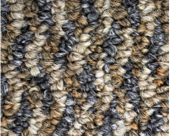
The carpeting in JPII Rooms 5 & 6 will be replaced.