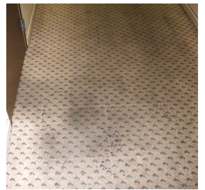
Worn carpet will be replaced with vinyl "wood" planks in the:

JP II Building hall, All Saints room, and Youth Center.